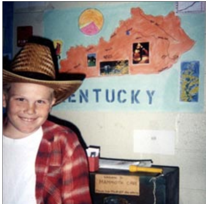
Students participating in the Cynthia Mann Elementary School States Fair dressed as state representatives and used their technology skills to share information with parents and guests.

presentations on their state. The presentations were compiled onto a CD-ROM for parents and guests to purchase, turning the event into a fundraiser as well. Students even