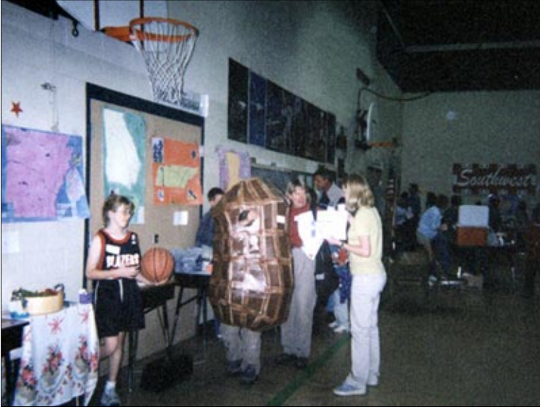
Students used spreadsheets, desktop publishing software, and multimedia programs to generate comprehensive presentations.

“ Students enhanced their skills across virtually all curricular areas, including geography, history, social studies, English, art, math, speech, and technology. ”