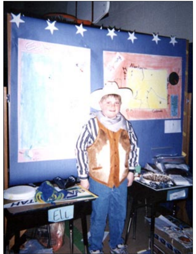
A fifth grader proudly stands by his States Fair booth.