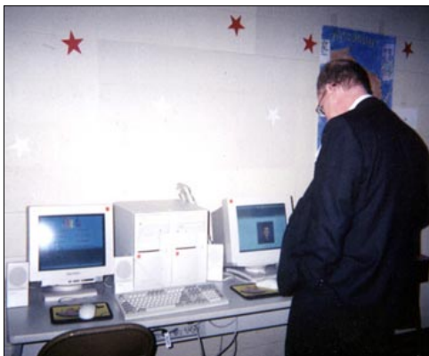
Parents, community members, and other guests stopped at each booth to gather information on the state's government, climate, geography, industry, famous attractions, and more.